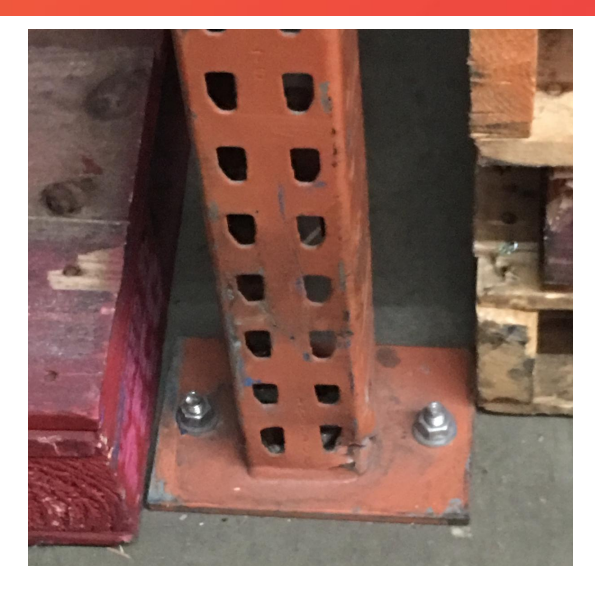
STEP #1 - IDENTIFY DAMAGED RACKING

With a factory-trained crew, bespoke engineered rack repair kits, and the experience to repair rack nationally, Lean Inc. is able to repair all racking types.