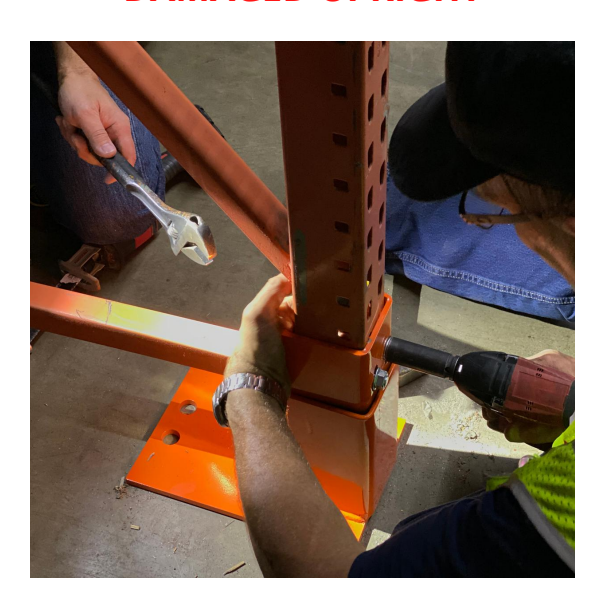
STEP #4 - BOLT & ANCHOR NEW KIT IN PLACE