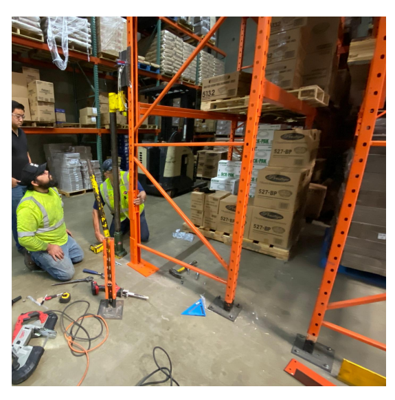
STEP #3 - REPLACE DAMAGED RACKING WITH KIT